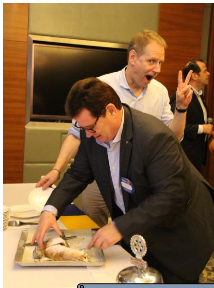
Saddle and Yummy Apfelstrudel